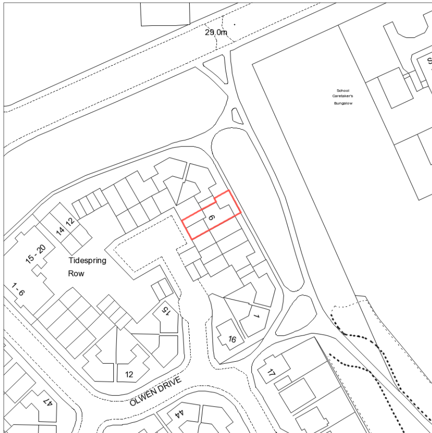
6, Tidespring Row, Hebburn